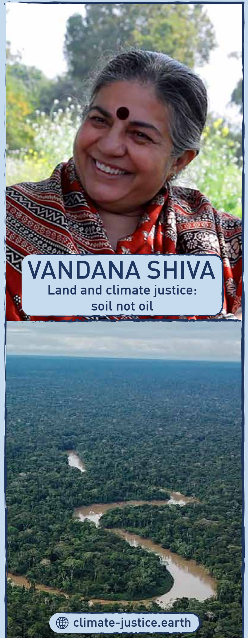
VANDANA SHIVA Land and climate justice: soil not oil