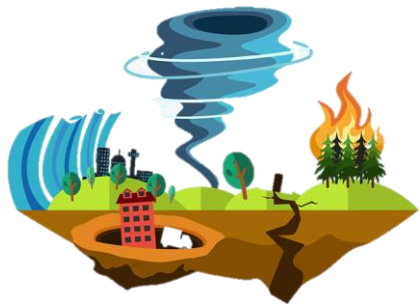
Climate Change Impacts