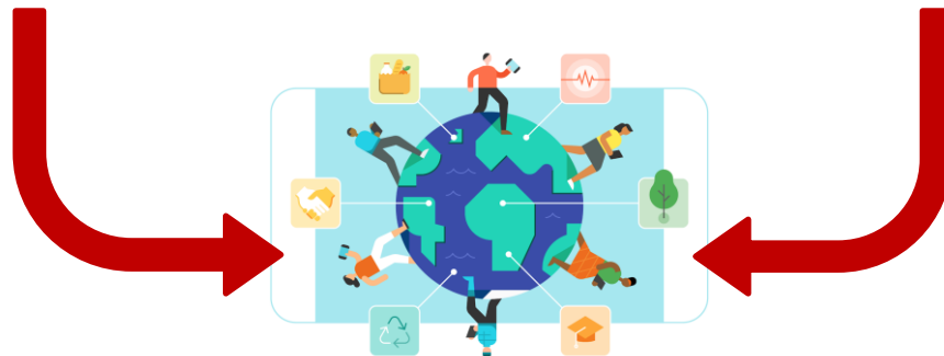
Human Rights Impacts

Climate justice puts humans at the centre of decision-making on climate change, for policies good for people and good for the planet